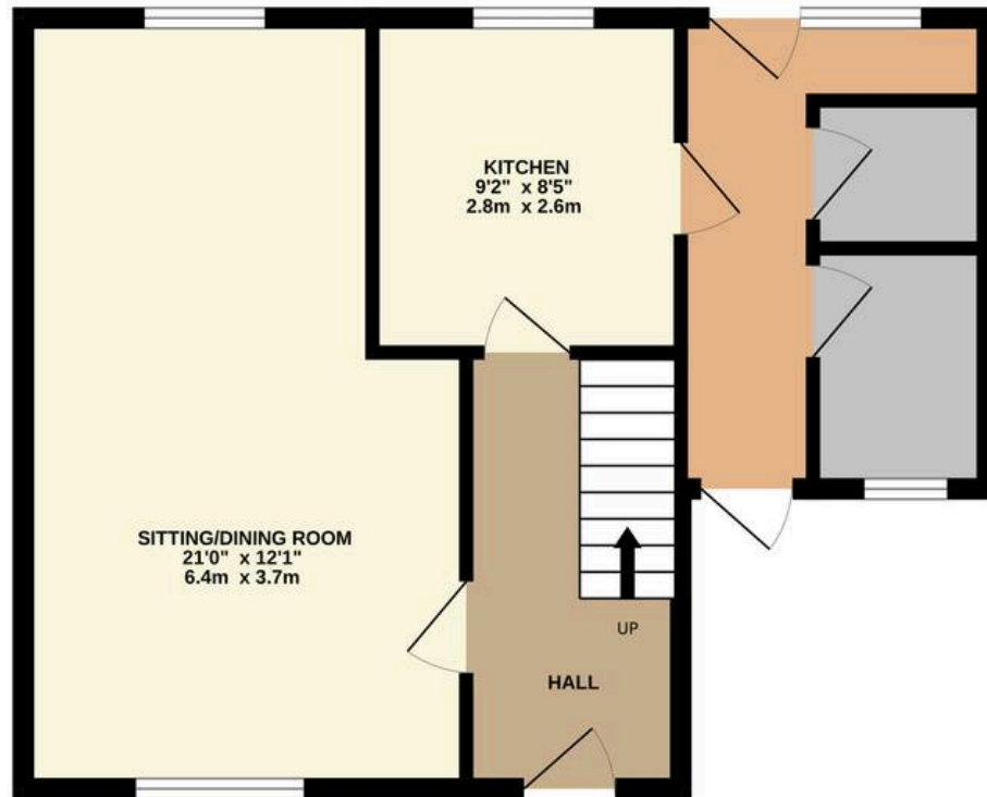
GROUND FLOOR 486 sq.ft. (45.1 sq.m.) approx.